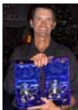
Peter Gwyther Winter Shield & Summer Cup